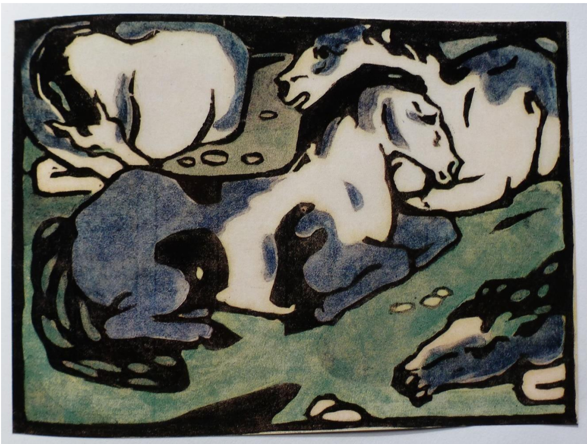
Horses Lying Down by Franz Marc.

1 - your drawing / design. It should be no more than 26cm x 20cm - it can be smaller. The design will be adapted and “picked apart” to make it suitable for the three blocks that we are going to work with. Getting the registration right with multiple blocks is something that we will pay special attention to. Here is an example of the sort of three colour print that you could be aiming for. Saskia is happy to help guide you with your design choice prior to the course start, this is strongly advised:)